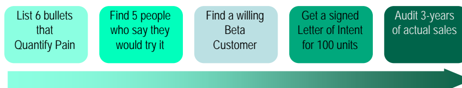
Clear and auditable nouns are paramount to proper go/no-go decisions and idea shaping

For example, one critical question asked of business ideas is, “Will anyone buy this?” After products are launched the answer is appropriately measured by looking at sales numbers for the past 3 years. When initially pondered, ideas may be several years away from actual sales data. However, this sales channel can be thinned backwards to auditable nouns that do indicate an appropriate thickness level all the way back into the concept stages. Thin nouns that are having a hard time being completed are trying to talk! Perhaps the idea is not worth pursuing...or not worth being pursued in the manner it is currently moving forward.